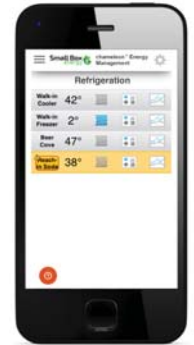
Alarm Monitoring for All Locations