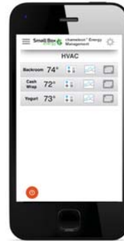
Zone Monitoring & Control