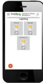
Lighting Control & Schedules