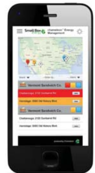
Alarm Monitoring for All Locations