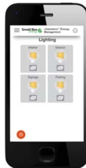
Lighting Control & Schedules