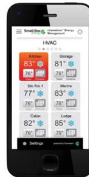
Zone Monitoring & Control