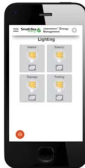
Lighting Control & Schedules