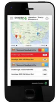
Alarm Monitoring for All Locations